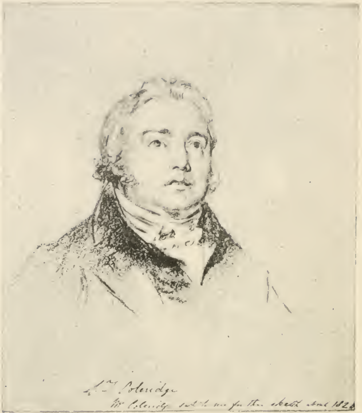
Samuel Taylor Coleridge from a drawing by C. R. Leslie R. A.